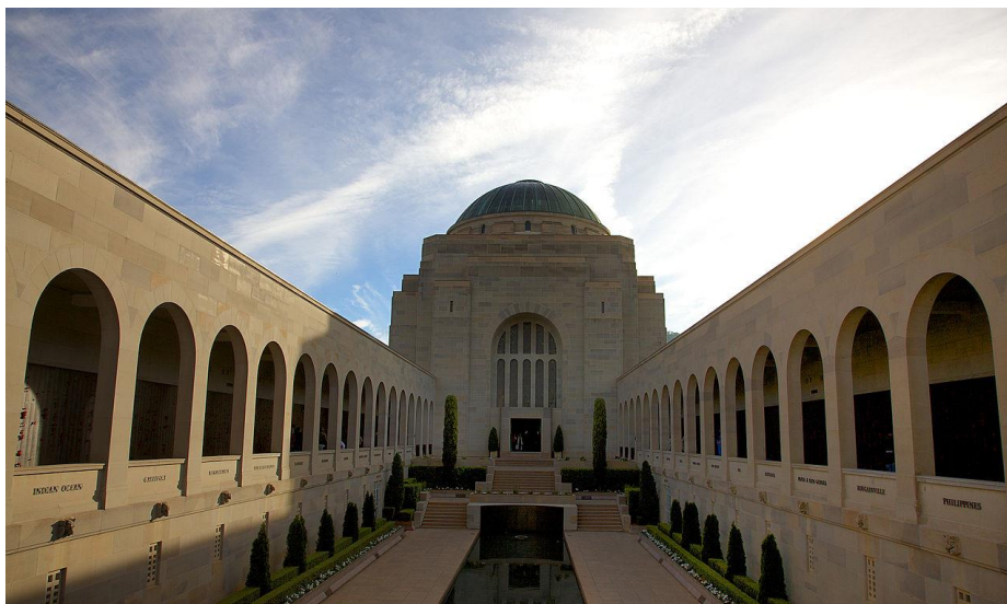
Commemorative Area of the Australian War Memorial